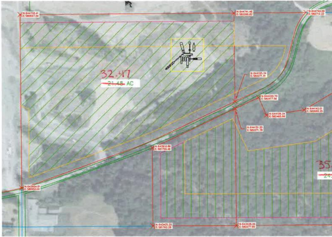
Subject Property's Aerial and PF-80 Zoning Maps